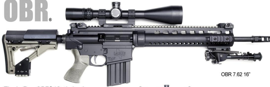
OBR 7.62 16"

The LaRue OBR® (Optimized Battle Rifle) was built from the ground up, using a newly designed upper-receiver platform. Both the upper and lower are CNC-machined from billet, for the optimum fit and consistency. The receiver components are designed with more material in critical areas to alleviate known issues of weakness in 7.62 platforms and to stiffen the receiver....translating into maximum accuracy.