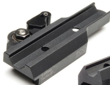
LT681 ACOG RCO Mount