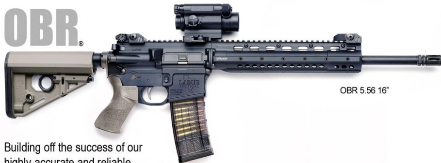
OBR 5.56 16"

Building off the success of our highly-accurate and reliable OBR® 7.62, we set out to apply the same proven design features into a 5.56 rifle. The result is a lightweight, and reliable tack driver that remains cool...even after high rates of fire. Like its 7.62mm sibling, both the upper and lower are CNC-machined from billet aluminum, for the optimum fit and consistency...translating into maximum accuracy.