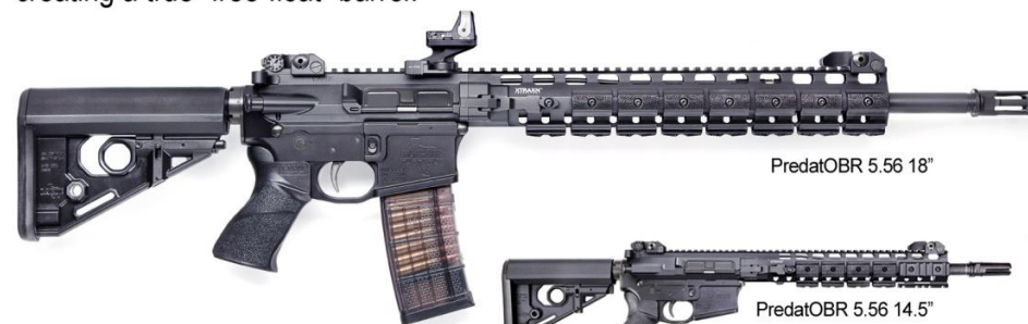
PredatOBR 5.56 18"