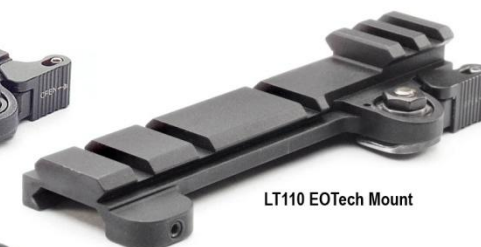
LT110 EOTech Mount