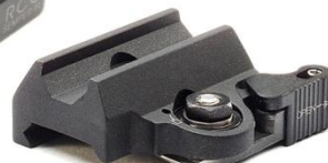
LT105 ACOG Compact Mount