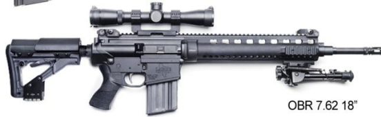
OBR 7.62 18"

The LaRue OBR® (Optimized Battle Rifle) was built from the ground up, using a newly designed upper-receiver platform. Both the upper and lower are CNC-machined from billet, for the optimum fit and consistency. The receiver components are designed with more material in critical areas to alleviate known issues of weakness in 7.62 platforms and to stiffen the receiver....translating into maximum accuracy.