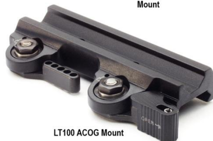
LT100 ACOG Mount