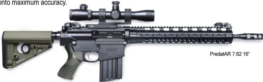
PredatAR 7.62 16"