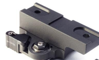
LT659 Aimpoint Comp M4 Mount