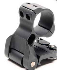
LT755 Short Pivot Mount (30mm, for Aimpoint 3X)