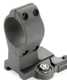
LT150 Aimpoint Comp M2 Mount

In addition to LaRue's extensive line of scope mounts, LaRue also manufactures a wide variety of quick disconnect mounts for general purpose non-magnified optics. LaRue has developed a mount for everything from micro red dots to low magnification combat optics.