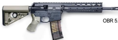
OBR 5.56 12"

Building off the success of our highly-accurate and reliable OBR® 7.62, we set out to apply the same proven design features into a 5.56 rifle. The result is a lightweight, and reliable tack driver that remains cool...even after high rates of fire. Like its 7.62mm sibling, both the upper and lower are CNC-machined from billet aluminum, for the optimum fit and consistency...translating into maximum accuracy.