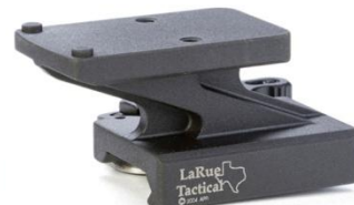
LT827 Trijicon RMR Mount