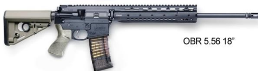
OBR 5.56 18"