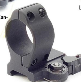
LT659-HK Aimpoint Comp M4 Mount