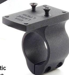
LT635 TA33 Docter Optics Mini ACOG Mount