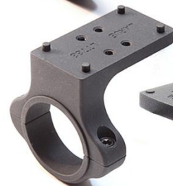
LT788 Burris/Docter Optic and Trijicon RMR Scope Ring Mount (34mm w/ 30mm step down)