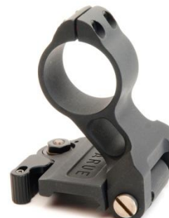
LT755 Tall Pivot Mount (30mm, for Aimpoint 3X)