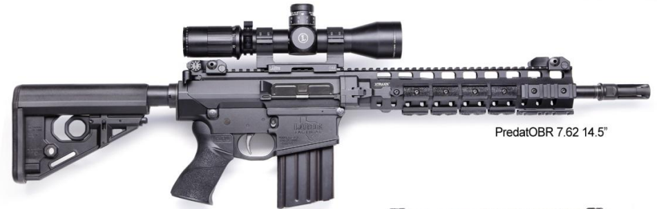
PredatOBR 7.62 14.5"