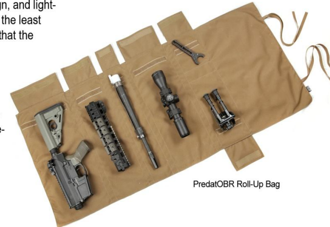
PredatOBR Roll-Up Bag

The PredatOBR's barrel can easily be removed with the supplied Barrel Wrench. No need to remove the gas tube, gas block or muzzle device. Reverse the process to reinstall. Hand-tighten Barrel Nut and torque to approximately 40-50 foot pounds.