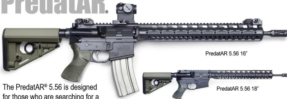
PredatAR 5.56 16"