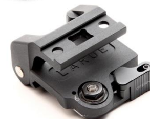
LT755-EO EOTech Pivot Mount