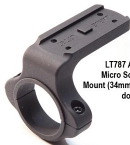
LT787 Aimpoint Micro Scope Ring Mount (34mm w/ 30mm step down)