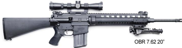
OBR 7.62 20"